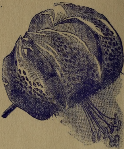
LILIUM SPECIOSUM (See page 3)